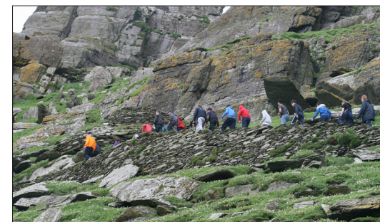
Celebrating 150 years of Spiritan Education