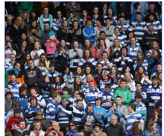
Celebrating 150 years of Spiritan Education