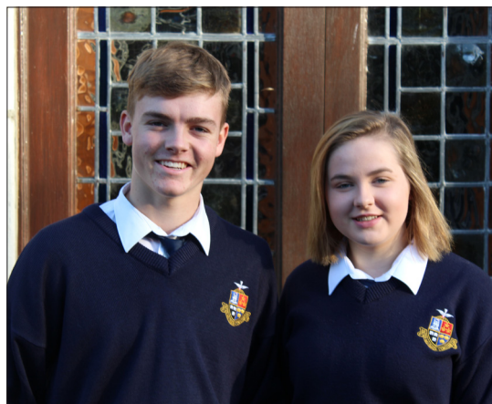
Maximum “A” Grades Junior Cert. 2015