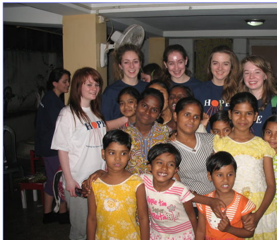
Rockwell College C.S.Sp. 1864-2014