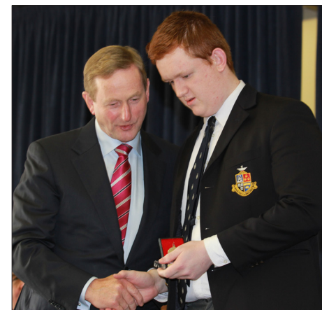
U.C.D. Entrance Scholarship 2014

Celebrating 150 years of Spiritan Education