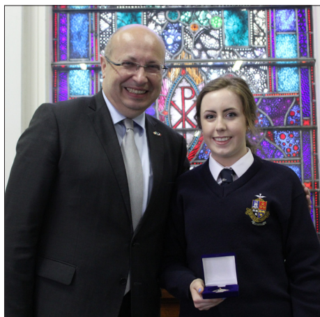
Top Leaving Cert. points 2015

“Students were active participants in all lessons and responded with interest and purpose. The positive classroom atmosphere and rapport between students and their teachers significantly enhanced the interactive and communicative quality of these lessons.” DES Geography Report.