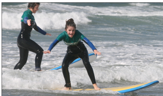
Rockwell College C.S.Sp. 1864-2014

All pupils take the mandatory two week Work Experience period as required under DES guidelines for the Transition Year programme.